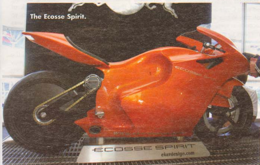
The Ecosse Spirit.